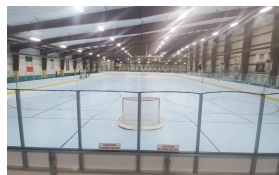
OPEN FIELD 2