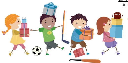
OPEN FIELD 1